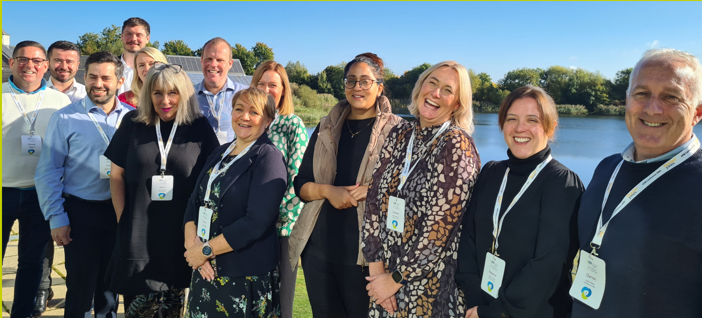
2022 Mutual Leadership cohort, at the AFM Annual Conference