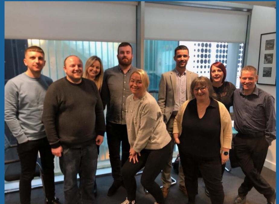
2022 Stepping Up cohort